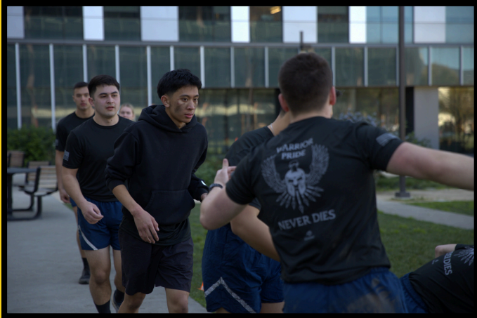
Warrior Challenge 2026

At the conclusion of the Warrior Challenge, Detachment 088 (Sacramento State) finished first with 11 points, reclaiming the trophy. Detachment 035 (Fresno State) placed second with 10 points, followed by Detachment 045 (San José State) with 8 points and Detachment 085 (UC Berkeley) with 6 points.