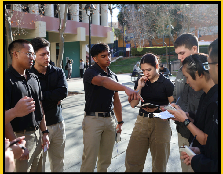
BCL cadets during LLAB 19

The process to earn an EA is very rigorous and selective. Because of this, earning an EA is a significant milestone reflecting both national-level excellence and the culmination of a cadet’s hard work, consistency, and growth throughout their first two years as cadets.