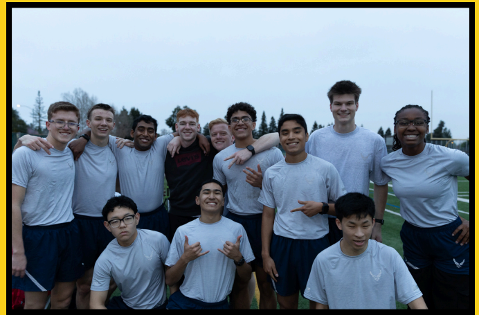
BC cadets during PT