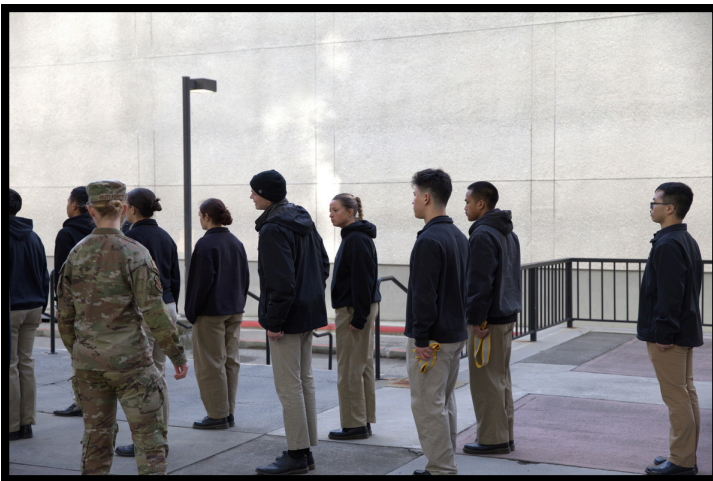
BCL cadets during LLAB 20

These cadets will attend Field Training this summer, where they will be evaluated on leadership, followership, discipline, adaptability, and their ability to perform under pressure in demanding and dynamic environments. Field Training serves as the capstone of their GMC experience and a critical step in their development as future officers.