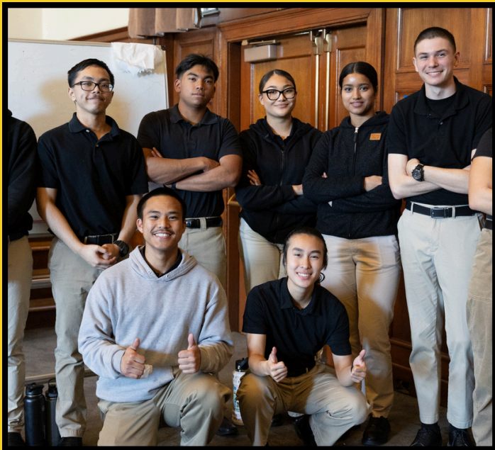
BCL cadets during LLAB 22