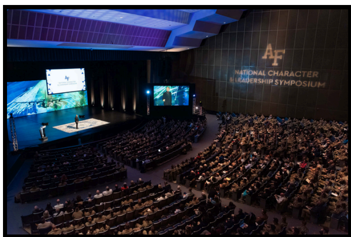
National Character & Leadership Symposium 2026

If you are interested in supporting these efforts, please mark April 21st on your calendar and consider taking part in this year's Day of Giving. Your support, no matter the amount, helps strengthen the foundation of cadet programs and directly contributes to the continued success of its members. Even a small contribution, when combined with others, creates a meaningful impact and helps open doors for future opportunities. We encourage you to be a part of this effort and help make a difference. Your support truly goes a long way.