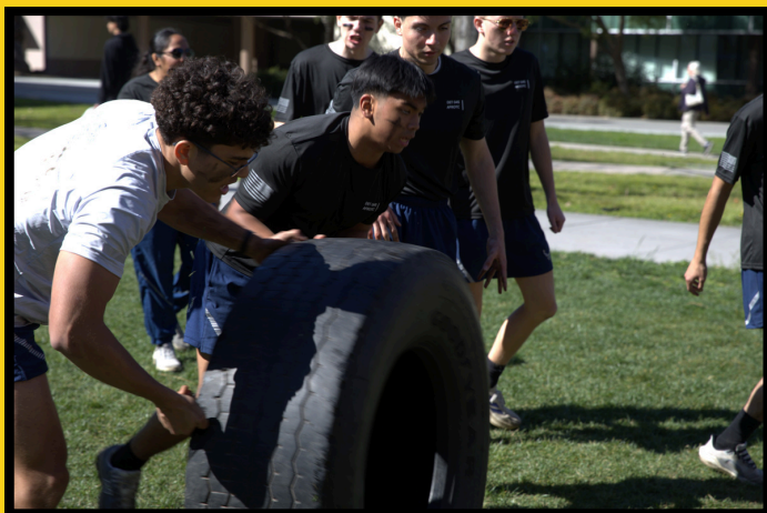
Warrior Challenge 2026

More than just a competition, the Warrior Challenge serves as a critical training environment where cadets develop leadership, adaptability, and teamwork while strengthening the bonds that unite the AFROTC community across Northern California. Events like these provide cadets the opportunity to lead in dynamic environments, build trust across units, and prepare for the collaborative and high-pressure situations they will face as future Air Force officers.